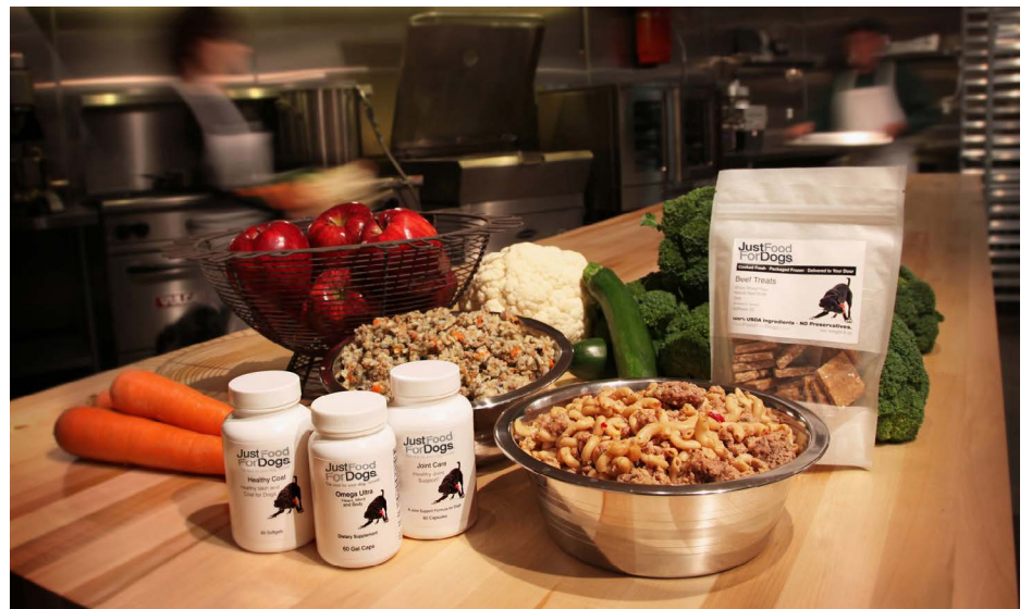
Display of Just Food For Dogs meals, supplements and treats.